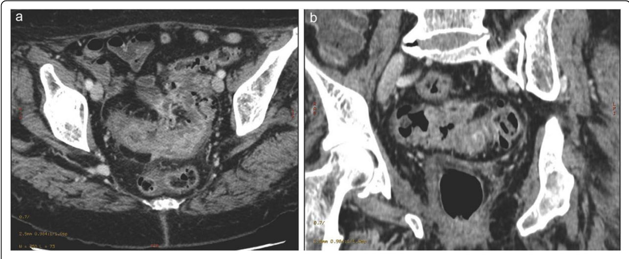
Figure 1 Contrast-enhanced MDCT 2D reconstruction on axial –oblique (a) and coronal oblique (b) planes shows a neoplastic thickening of the colonic wall (sigmoid tract) in presence of diverticulitisis.

tomography colonography (CTC) seems to be a reasonable alternative in follow-up of patients with symptomatic diverticular disease [45]. In recent years, magnetic resonance imaging (MRI) has gained popularity, because it lacks the ionizing radiation and even if CT remains the modality of choice; however MRI can similarly demonstrate findings of diverticulitis and could be useful in diagnosis of ischemic colitis [46,47]. Although, colonic diverticulitis is easily diagnosed and classified (graded) by CT than by ultrasound (US), it is important to be aware of the US signs of diverticulitis considering that US is often used as a first modality in the diagnostic approach to the acute abdomen.