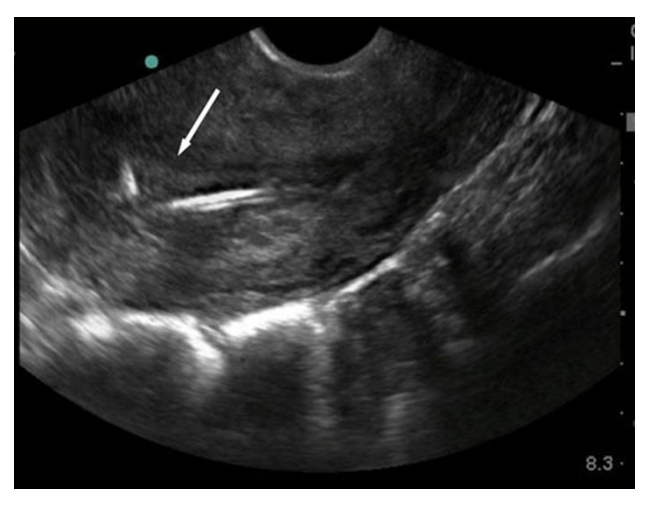
Fig. 1 Bedside transvaginal ultrasound in long-axis orientation showing IUD (white arrow) in place

It has been estimated that pregnancy occurs approximately 2% of the time with an IUD in place [1]. According to